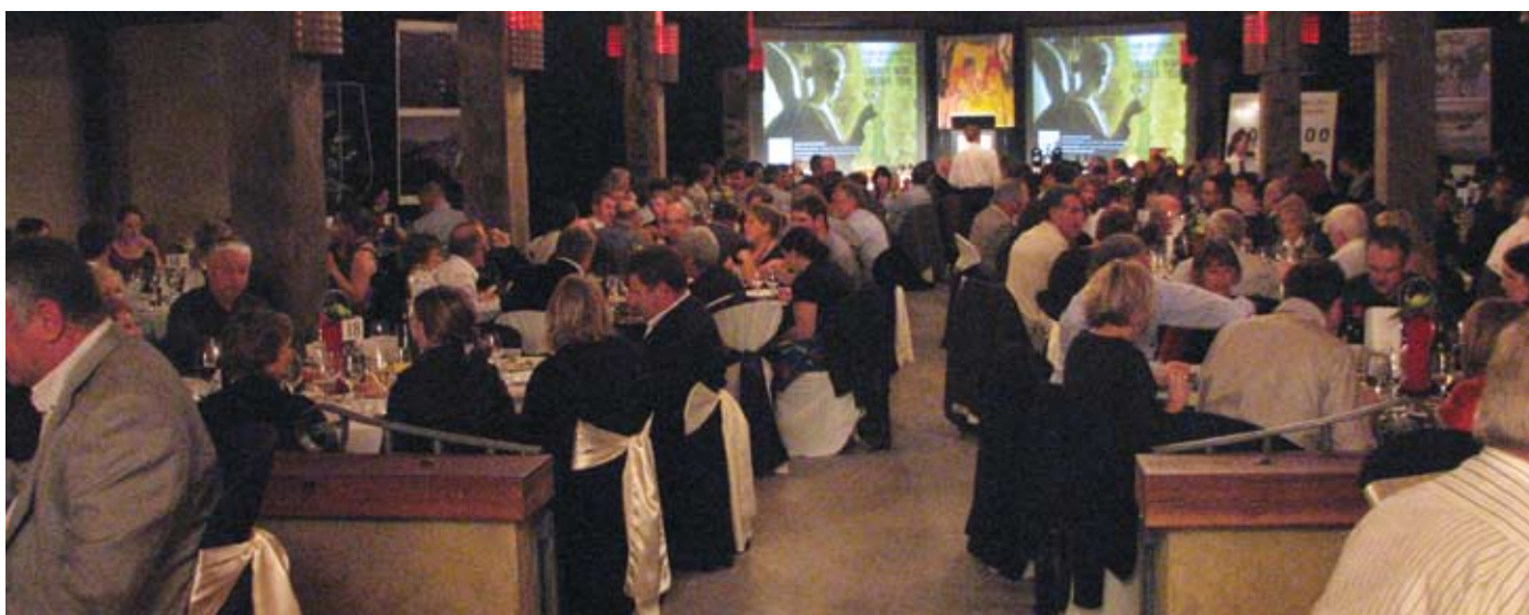
A SCENE FROM THE TOM MCDONALD CELLAR AT CHURCH ROAD WINERY

Midlands Hawke's Bay Charity Wine Auction and dinner at the Tom McDonald Cellar at Church Road Winery raised more than $131,000 for Cranford Hospice.